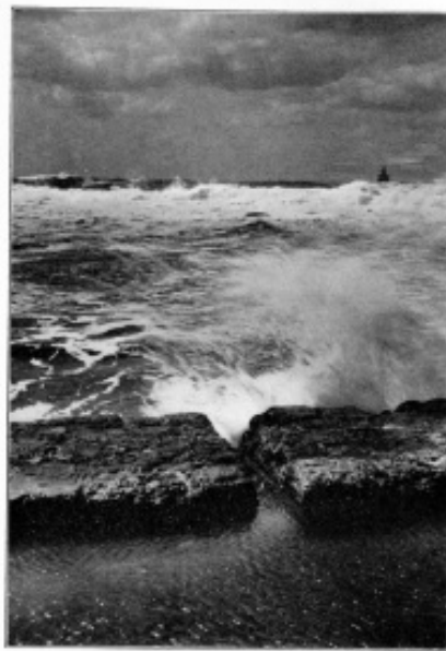
STORMY SEA BREAKING OVER ROCKS OFF JAFFA