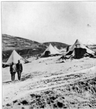
SOLDIERS' TENTS IN SAMARIA

More amenities were exchanged, the upshot of which was that my four friends and I were given permission to sleep at the inn—a humble place, but infinitely better than the mosque. It was all perfectly simple.