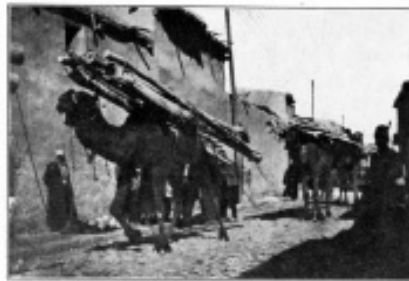
CAMELS BRINGING IN NEWLY CUT TREES, DAMASCUS

We felt sure that the Turkish defeat would put a damper on the arrogance of the soldiery. But even the Mohammedan population were hoping that the Allies would push their victory and land troops in Syria and Palestine; for though they hated the infidel, they loved the Turk not at all, and the country was exhausted and the blockade of the Mediterranean by the Allies prevented the import and export of articles. The oranges were rotting on the trees because the annual Liverpool market was closed to Palestine, and other crops were in similar case. The country was short, too, of petroleum, sugar, rice, and other supplies, and even of matches. We had to go back to old customs and use flint and steel for fire, and we seldom used our lamps. Money was scarce, too, and, Turkey having declared a moratorium, cash was often unobtainable even by those who had money in the banks, and much distress ensued.