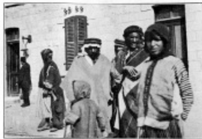
RAILROAD STATION BORN BETWEEN HAIFA AND DAMASCUS