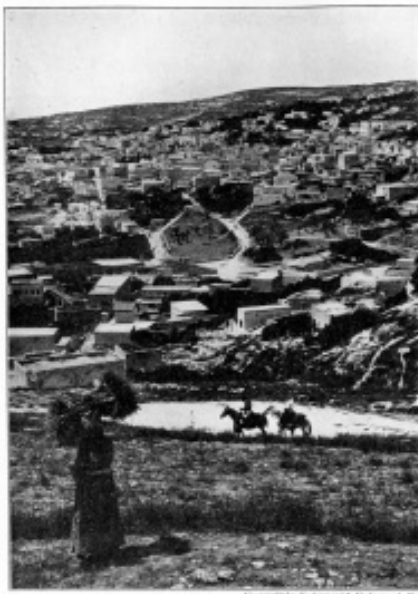
NAZARETH, FROM THE NORTHEAST

When I learned of this tragedy, I determined to get out of the army and return to my village at all costs. Nine Turkish officers out of ten can be bought, and I had reason to know that the officer in command at Saffêd was not that tenth man. Now, according to the law of the country, a man has the right to purchase exemption from military service for a sum equivalent to two hundred dollars. My case was different, for I was already enrolled; but everything is possible in Turkey. I set to work, and in less than two weeks I had bought half a dozen officers, ranging from corporal to captain, and had obtained consent of the higher authorities to my departure, provided I could get a physician's certificate declaring me unfit for service.