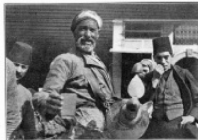
A LEBONANESE-SELLER OF DAMASCUS