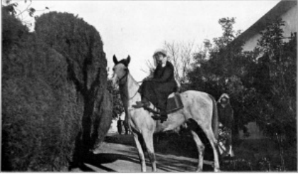
THE AUTHOR'S SISTER ON HER HORSE TATAN