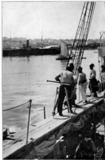
BEIRUT, FROM THE DECK OF AN OUTGOING STEAMER

At last the boat got away, and five minutes later we were mounting the side of the Des Moines. Throngs of refugees covered the decks of the cruiser. Their faces showed tension and anxiety. Their presence there seemed too good to be true, and all awaited the moment when the ship should heave anchor. A Filipino sailor showed us about, and as he spoke Italian, I told him I wanted to be hidden somewhere till the ship got under way. I felt that even yet we were not entirely safe. That my fears were justified I discovered shortly, when from our hiding-place I saw the shopkeeper approaching in a small boat with a Turkish officer. They looked over all the refugees on the deck, but searched for us in vain. After a half-hour more of uncomfortable tension the engines began to sputter, the propellers revolved, and—we were safe!