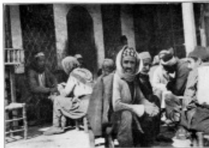
IS A NATIVE CAFÉ, HAFÉD

Now I knew that our suffering had been useless. Whenever the Turkish authorities wished, the horrors of the Armenian massacres would live again in Zicron-Jacob, and we should be powerless to raise a hand to protect ourselves. As we came limping home through the streets of our village, I caught sight of my own Smith & Wesson revolver in the hands of a mere boy of fifteen—the son of a well-known Arab outlaw. I realized then that the Turks had not only taken our weapons, but had distributed them among the natives in order to complete our humiliation. The blood rushed to my face. I started forward to take the revolver away from the boy, but one of the old men caught hold of my sleeve and held me back.