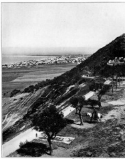
HAIFA AND THE BAY OF AKKO. LOOKING EAST FROM MOUNT CARMEL.