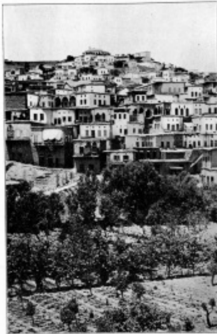
THE CHRISTIAN TOWN OF ZAHLEH IN THE LEBANON

As I proceeded on my journey northward, I hoped to find consolation and brighter prospects in the independent province of the Lebanon. Few Americans know just what the Lebanon is. From the repeated allusions in the Bible most people imagine it to be nothing but a mountain. The truth is that a beautiful province of about four thousand square miles bears that name. The population of the Lebanon consists of a Christian sect called Maronites and the Druses, the latter a people with a secret religion the esoteric teachings of which are known only to the initiated, and never divulged to outsiders. Both these peoples are sturdy, handsome folk. Through the machinations of the Turks, whose policy is always to "divide and rule," the Maronites were continually fighting against the Druses. In 1860 Turkish troops joined with the Druses and fell upon the Maronites with wholesale massacres that spread as far south as Damascus, where ten thousand Christians were killed in two days.